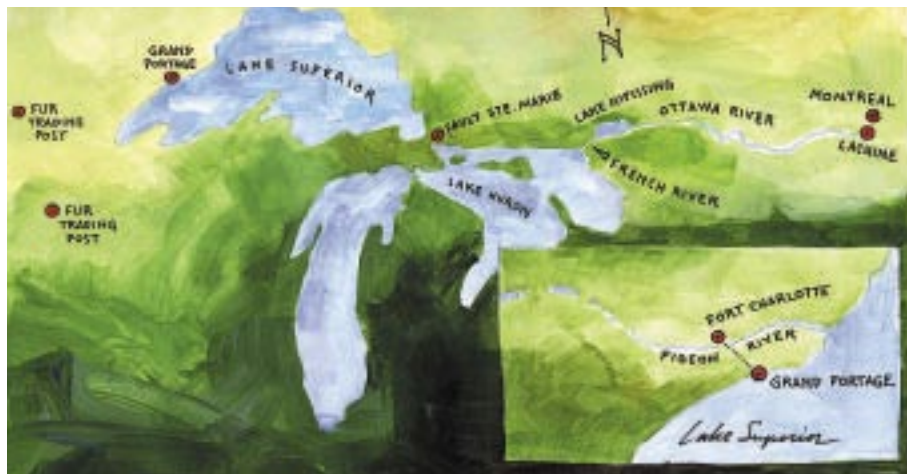
Trade route and Grand Portage trail (inset): 8 1/2 miles post to post.

Voyageurs paddled 30 miles or more a day—55 strokes per minute for 14 hours. They paddled before dawn and sometimes long after dark. They stopped every hour or so to smoke their pipes, but breaks were brief because the voyage was long and summer was short in the north.